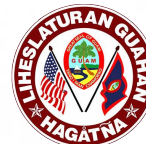
LOURDES A. LEON GUERRERO I Maga'hågan Guåhan Governor of Guam

38GL-26-2187 Messages and Communications